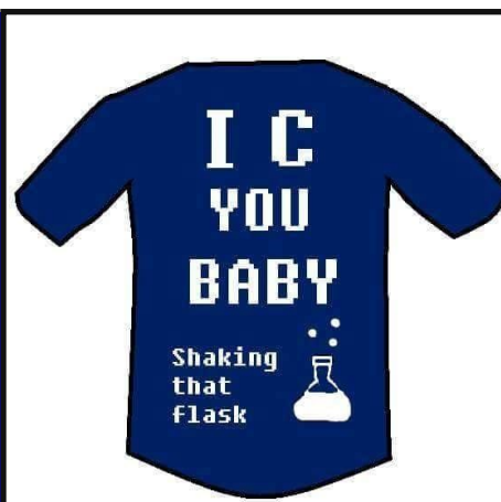
FM T-shirt Design Winner 2016